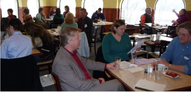
SCIL participants practice the art of Emphatic Listening at the January 2011 session.

Sauk County Institute of Leadership Sauk County UW-Extension 505 Broadway Baraboo, WI 53913