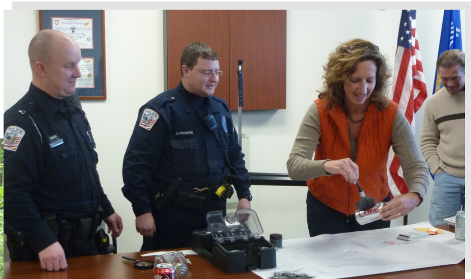
A SCIL class member trying her skill at "dusting for fingerprints" while two Baraboo Police Department officers look on.