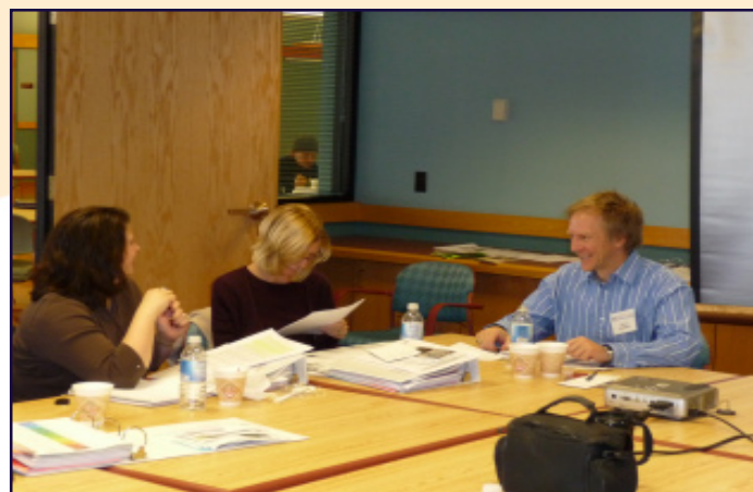
2009 SCIL class members discuss course materials in the February session which focused on Education, Arts & Humanities.