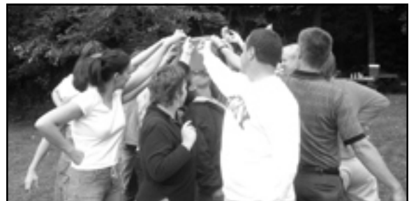
Let the learning begin! SCIL Team building exercise at Session 1, September 2005

Leadership Concepts & Team Building – September State and Local Government – October Community & Economic Development – November Justice, Civil Liberties and Security – December Family and Community – January Agriculture and Natural Resources – February Health Care – March Education – April May – Celebration of SCIL